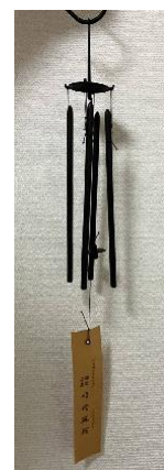
▲the Fire Chopstick Wind Chimes

A I dropped out of a university and became an apprentice to my father because I wanted to support him. Every day from morning to night, my father was beating glowing iron sticks with a hammer, bent in front of a furnace that reached 1300 degrees. As I saw his working style, I trained to create a sound of my own. It took me five years to create a beautiful sound. I spent the next ten years creating a steady, clearly lingering sound. Still, I cannot create a beautiful sound if my mind is cluttered. I will try to be sincere in creating a beautiful sound.